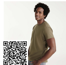
DOGO PREMIUM CA6502